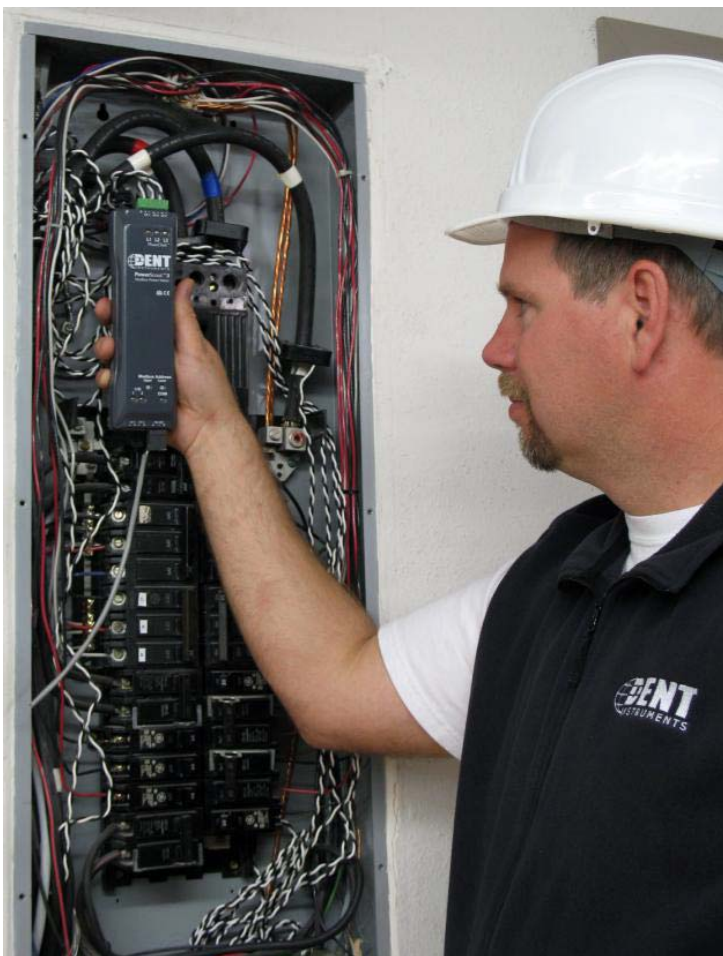
The Next Generation PowerScout™ 3 with Full Utility Metering™.