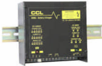
(shown in protective cover)