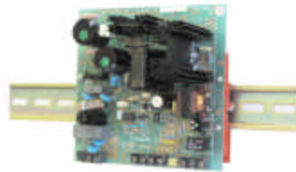
(shown as open frame unit)